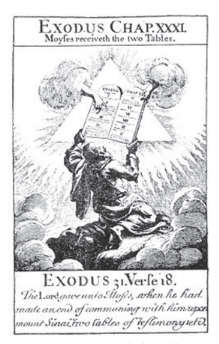
Fig. 1.1—Moses with the Tablets

The Ten Commandments is also known as the Decalogue—meaning ten words or utterances. It may be considered a symbolic, spiritual core of Mosaic Law, much as the periodic table of the elements in science categorizes the discovered fundamental substances that make up the universe. These ten words written on stone symbolize, in essence, the way to act with both God and man, but are meanings engraved in more than just the words on these stone tablets? Are there meanings in the shapes of the tablets themselves? In Exodus 32:15 it states that the tablets had writing on both sides, that the writings could be seen through the tablets. Could this indicate that there are meanings for us in the words and the shape of the tablets as well as through the very stone itself? Remember, literacy of the general population is a recent event in humankind's history. Nowhere in the Bible are these shapes described. My intuition is that they are two triangular tablets or tables.